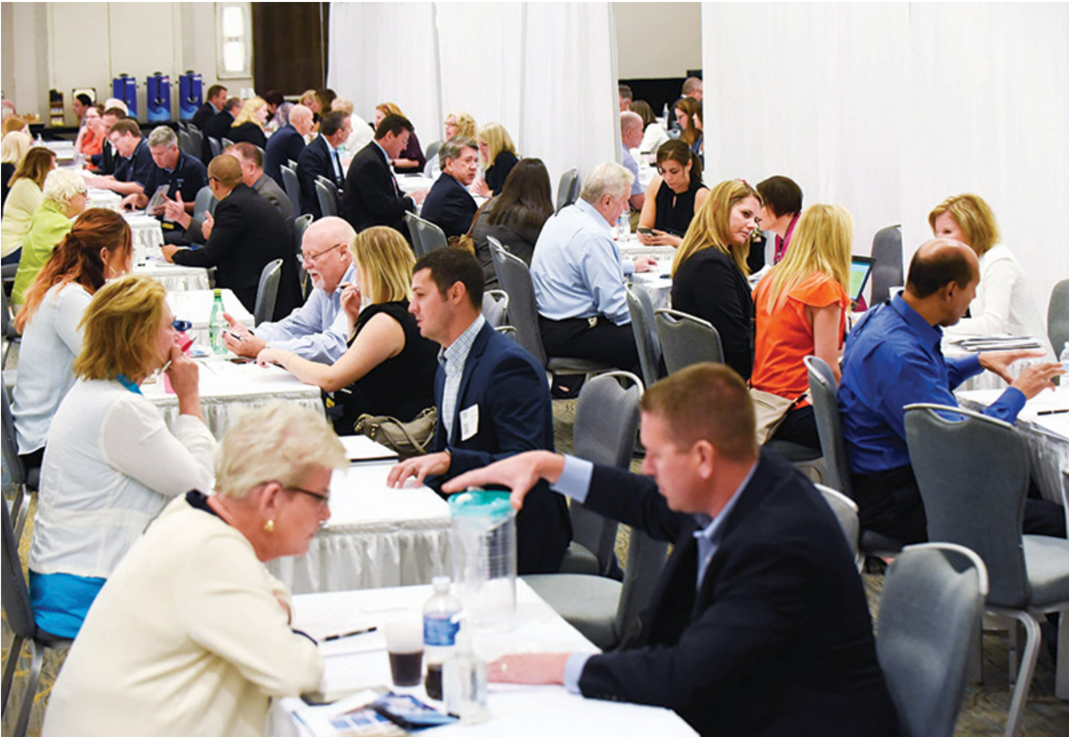
26. SPEED SELLING During the ORX Big 10 Reverse Trade Show, invited leaders from the nation's highest volume surgical facilities welcomed reps